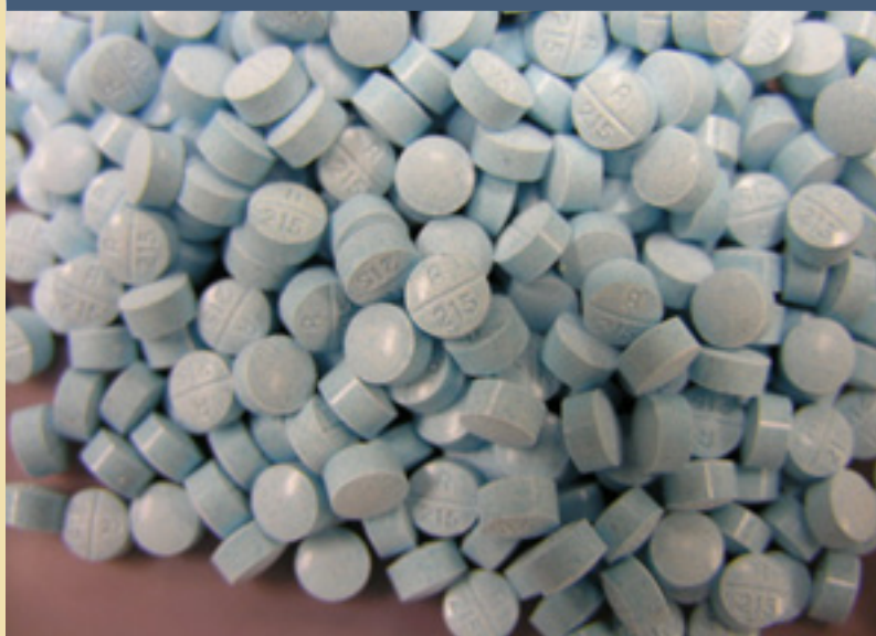
Figure 5: Counterfeit Oxycodone Pills Containing U-47700.